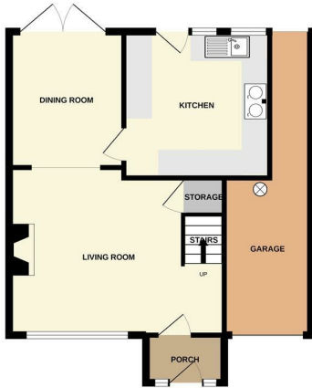
GROUND FLOOR 562 sq.ft. (52.2 sq.m.) approx.